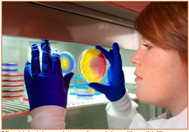
Microbiologist examining culture plates with methicillinresistant Staphylococcus aureus bacteria.

Commonly identified antimicrobial-resistant forms of these bacteria include methicillin-resistant Staphylococcus pseudintermedius (MRSP) and methicillin-resistant Staphylococcus aureus (MRSA), which are frequently identified in dogs and people, respectively.